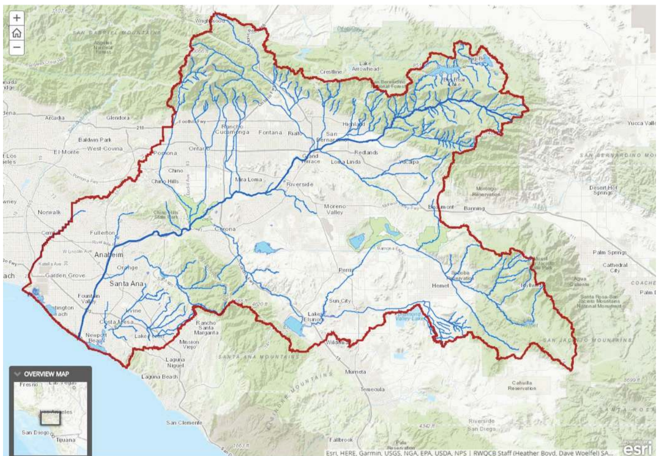
FIGURE 1: Santa Ana River Watershed boundaries

The Santa Ana River Watershed was identified as an ideal pilot location because of its advanced water governance. Water resource managers in this watershed have embraced integrated regional water management (IRWM), and SAWPA has developed a “One Water, One Watershed” (OWOW) plan to advance water management in the region and assess catchment sustainability. 1 Because of this preexisting planning process and governance structure, the catchment is well-studied and water data is relatively easily available. Facilitated engagement in the process of updating the OWOW plan, including meetings with SAWPA staff, helped companies align their targets with public sector efforts. In situations and catchments where public sector management is less robust, companies may need to seek data and information from academics and consultants, or compile data independently to inform the target-setting process.