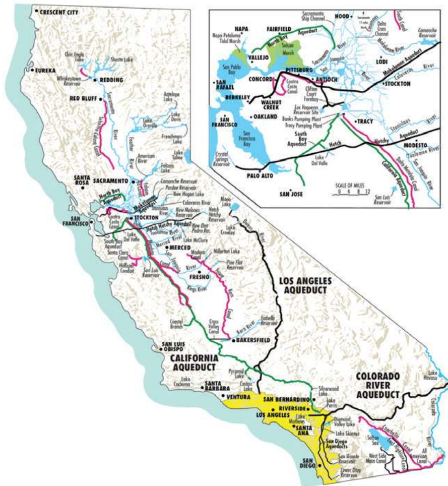
FIGURE 2: System of water imports to southern California

Water users depend not just on local surface and groundwater (50 percent of supply), but also on water imported from northern California and the Colorado River (30 percent of supply). Imported water from northern California has its source in the Sierra Nevada mountains and reaches the SARW via the State Water Project (California Aqueduct). Water coming from the east has its source in the Rocky Mountains and reaches the SARW via the Colorado River Aqueduct. See Figure 2 below for a map of imported water systems.